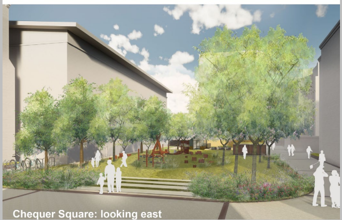
Chequer Square: looking east