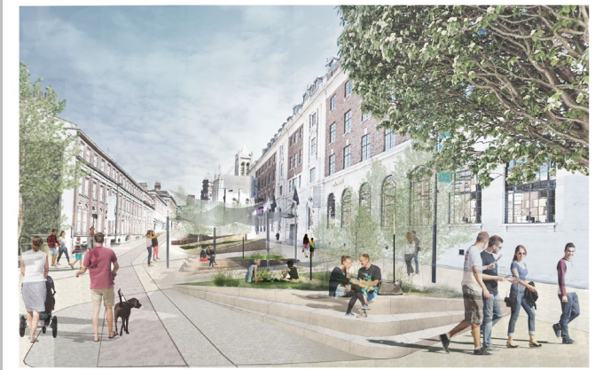
A concept design of four key sites as part of a wider city Public Transport Investment Programme to create a child friendly city as well as helping to respond to climate change