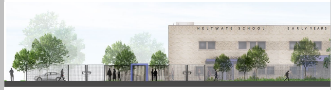
A new specialist SEND early years facility with associated external play spaces to mitigate tree losses and improve biodiversity