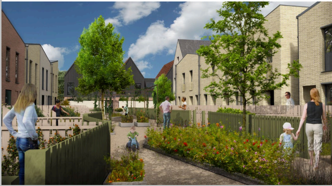
An exemplar largest UK Passivhaus development in Norwich completed with rain gardens and amenity green space